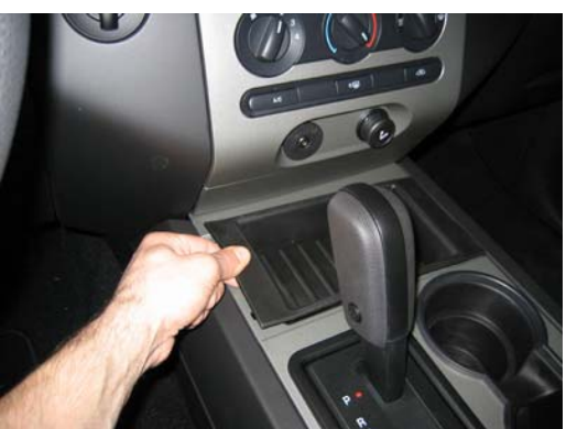
Remove accessory pocket liner as shown above